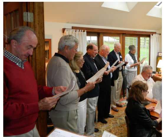
And our hosts! Snap, snap, snap!